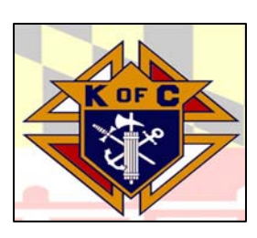
Other Councils who have supported us in the past 3 months are: Council #2065 Council #8159 Council #1470